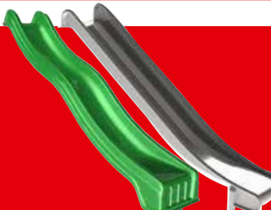
Hy-Slide Green / Hy-Slide Steel

Shock-absorbing properties of playground area surface should comply with EN-1176 (e.g. rubber, mulch, sand, grass, gravel rated for a fall height \geq 1.5 m)